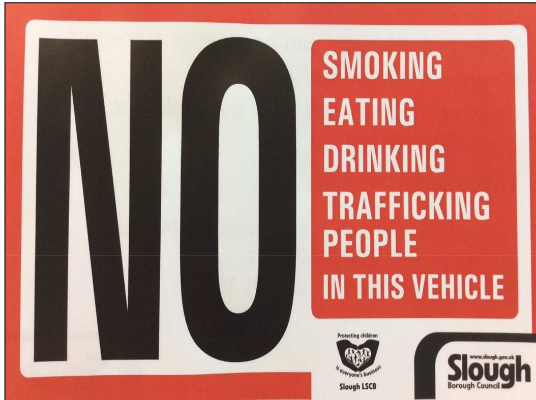
Slough Borough Council