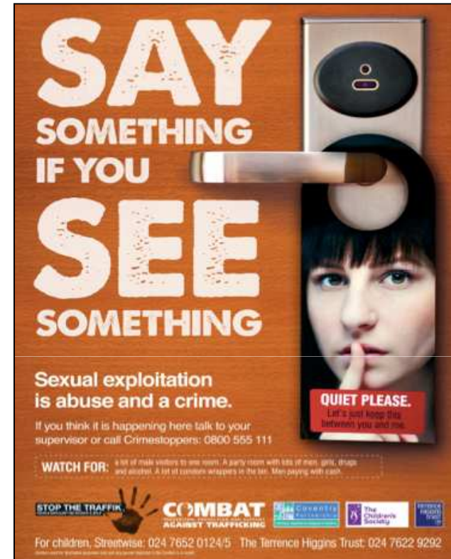
Peterborough City Council